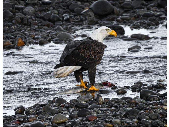
2025 prize-winning eagle photo by Antonio Liberta