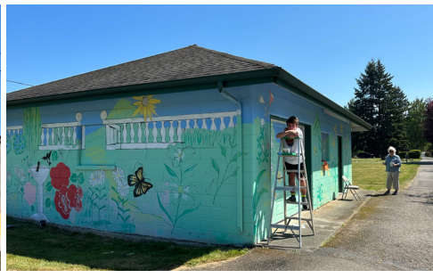
Cemetery Garden Mural by Shiela Arnold