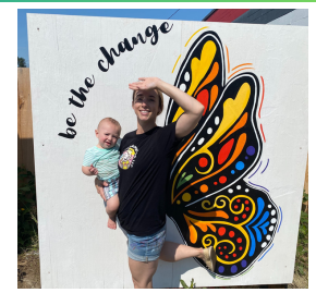
Art Wings by Lori Angdahl installed downtown